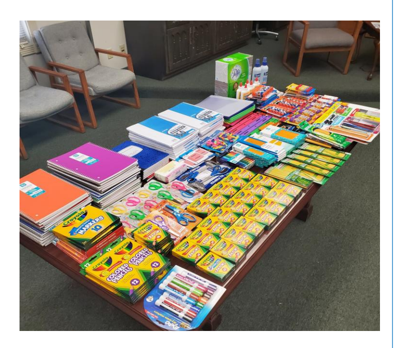
Thank you to everyone who donated to our school supply drive! We delivered the supplies to the Boys and Girls Club on August 13, 2020. We hope to have even more to donate next year!