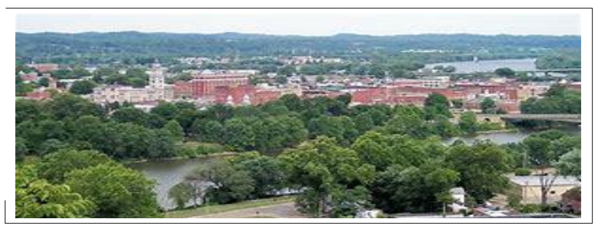
August 2020 Newsletter